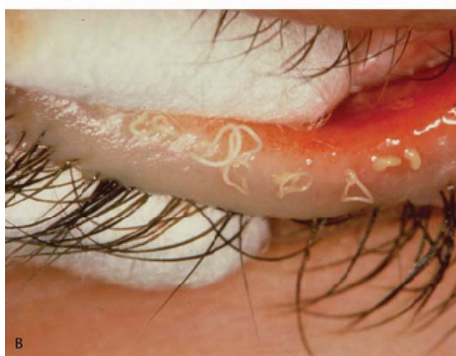
FIGURE 6. A, NOMGD with recalcitrant obstruction despite forceful expression. The lower eyelid is compressed between a swab on the palpebral conjunctival surface and the thumb on the outer eyelid surface. Despite the use of maximum force approaching 275 g/mm 2 (approximately 80 psi), the glands do not yield significant secretion. Before the application of forceful expression, the lids, eyelid margins, and meibomian gland orifices appeared normal. However, with forceful expression, the orifices evidenced elevated whitish plugs. B, NOMGD yielding secretion with forceful expression. The lower eyelid is compressed between 2 swabs on the surface of the palpebral conjunctiva and on the outer eyelid surface. Before expression, the lids, eyelid margins, and orifices appeared normal; however, standardized diagnostic expression failed to express secretion. The application of forceful expression almost immediately produced copious secretion on the form of filaments, indicating narrowing of the distal portion of the ducts, near the orifice. The color of the secretion varied from white to semipurulent.

glands yielding liquid secretion. The instrument, if made commercially available, is expected to provide the clinician and researcher with a standardized method of assessing meibomian gland functionality.