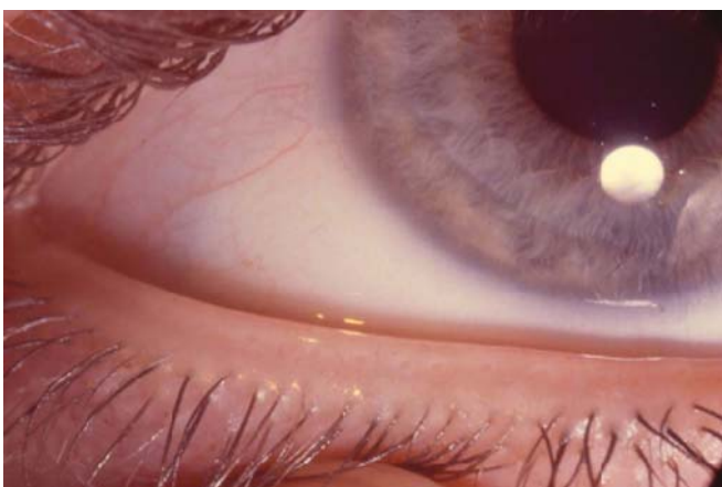
FIGURE 2. NOMGD. The eyelid is slightly everted with minimal digital pressure applied slightly below the eyelashes. The eyelid, lashes, and eyelid margins are without inflammation or other pathological signs. The meibomian glands could be normal or obstructed; therefore, diagnostic expression is required to determine meibomian gland functionality.

The correct anatomical term for meibomian glands is tarsal glands; however, because of common usage, meibomian glands will be used in this review. Meibomian glands are modified sebaceous glands numbering 25–40 in the upper tarsus and 20–30 in the lower. 1,16 The glands are tubuloacinar holocrine glands vertically embedded in the tarsal plate and opening onto the eyelid margin just anterior to the mucocutaneous junction. 17 The epithelium of the ducts is lined by stratified squamous keratinized epithelium but with only partial keratinization as compared with the skin. 18 The secretion of the glands consist of various polar and nonpolar lipids, especially phospholipids, sterol esters, wax esters, and