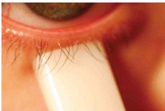
FIGURE 4. NOMGD with standardized diagnostic expression. The eyelid is slightly everted with 1.25 g/mm 2 pressure, applied slightly below the eyelashes. The eyelid, lashes, and eyelid margins are without inflammation or other pathological signs. The meibomian glands do not release any clear oil upon diagnostic expression, indicating that the glands are obstructed and would not be functional with the forces of deliberate blinking.

rectangular contact surface area of approximately 40 mm 2 with rounded edges; it applies a constant pressure, 1.25 g/mm 2 , to approximately one third of the external lower eyelid, allowing the simultaneous expression of approximately 8 meibomian glands (Figs. 3, 4). This pressure, 1.25 g/mm 2 , elevated the intraocular pressure from 12 to 18 mm Hg to approximately 35 mm Hg. Using this standardized pressure applied for a time of 10–15 seconds, they demonstrated significant correlation between dry eye symptoms and the number of meibomian