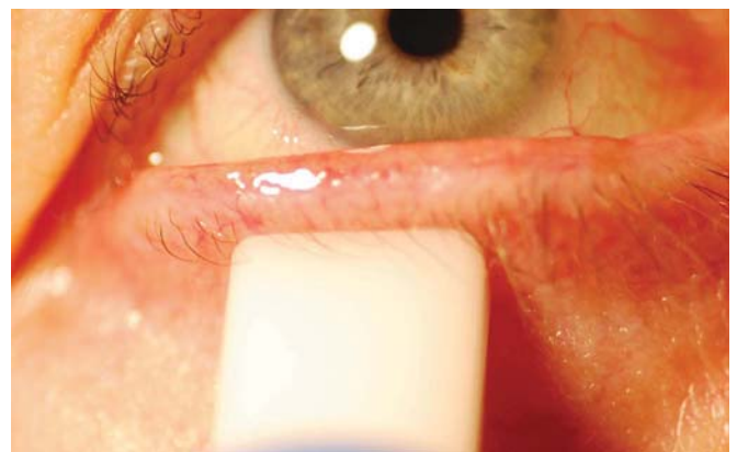
FIGURE 3. Obvious obstructive MGD with standardized diagnostic expression. The eyelid is slightly everted with 1.25 g/mm 2 pressure, applied slightly below the eyelashes. The eyelid, lashes, and eyelid margins evidence obvious inflammation. The meibomian glands do not release clear oil upon diagnostic expression, indicating that the glands are obstructed and would not be functional with the forces of deliberate blinking.

The lack of a standardized technique for assessing meibomian gland expressibility makes both clinical diagnosis and the conducting of clinical studies highly subjective. Korb and Blackie 74 reported the use of a custom expression device, designed to mimic the force applied to the meibomian glands during a deliberate or forced blink. 75,76 The device has a flat