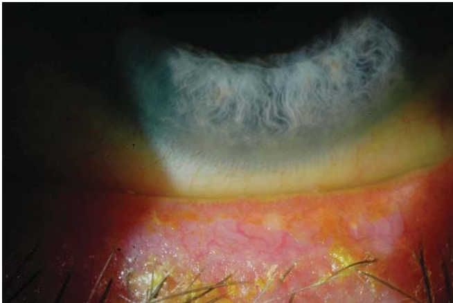
FIGURE 1. Obvious MGD. The eyelid is slightly everted with minimal digital pressure applied slightly below the eyelashes. The lower eyelid lashes evidence seborrheic scaling. The eyelid and eyelid margin evidence obvious inflammation and telangiectasia. The very minimal digital pressure resulted in purulent secretion.