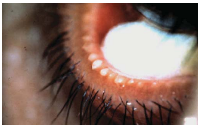
FIGURE 5. Obvious obstructive MGD with forceful expression. The eyelid and eyelid margin evidences obvious inflammation. The lower eyelid is compressed between a swab on the palpebral conjunctival surface and the thumb (or other firm instrument) on the outer eyelid surface. The amount of pressure required for forceful expression varies from 4 to 275 g/mm 2 (approximately 1.2–80 psi). This photograph illustrates that expression with adequate force may express copious amounts of inspissated secretion. The secretion may be white or purulent.

rectangular contact surface area of approximately 40 mm 2 with rounded edges; it applies a constant pressure, 1.25 g/mm 2 , to approximately one third of the external lower eyelid, allowing the simultaneous expression of approximately 8 meibomian glands (Figs. 3, 4). This pressure, 1.25 g/mm 2 , elevated the intraocular pressure from 12 to 18 mm Hg to approximately 35 mm Hg. Using this standardized pressure applied for a time of 10–15 seconds, they demonstrated significant correlation between dry eye symptoms and the number of meibomian